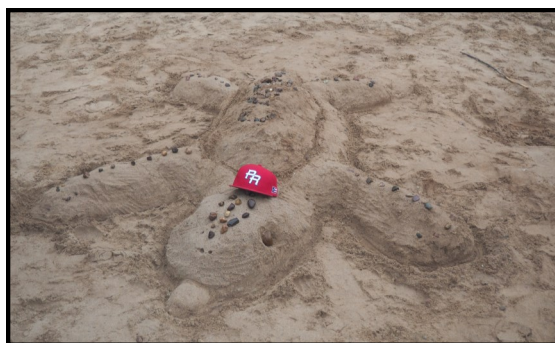
Cabin 12's winning turtle sculpture