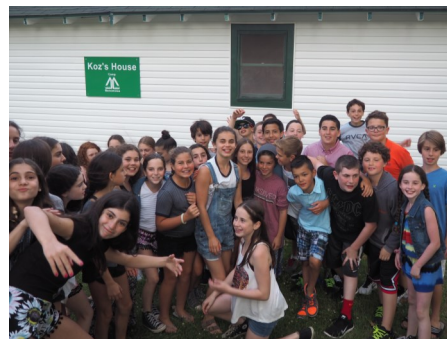
The boys with their new female friends at the camp social!