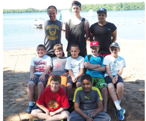
Cabin 8: Winners of cabin clean up this week! Great work guys!

Tip Five: Enjoy it! Turn it into a game, play music or sing during clean up. It will make a boring task fun; it will make it go quicker and it helps everyone start the day with a smile. Lucky canteen number 143.