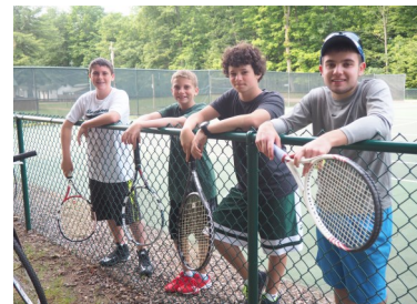
Senior's preparing for tennis against Timberlane!