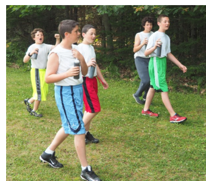
The British marching to glory in the squirt gun fight

Interview with the British & American captains on their role's: