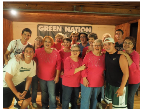
The counselors and Fox Sounds