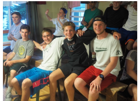
The CITs enjoying Fox Sounds