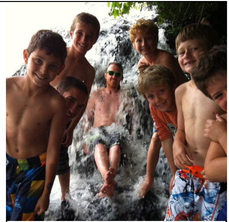
Sitting under the waterfall at Bond Falls!