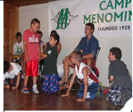
Cabin 13 perform their skit at Skit Night