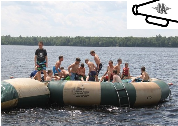
Everybody enjoying the trampoline on a hot day

Shawshank Redemption, because it teaches you to carry on, no matter what the situation.