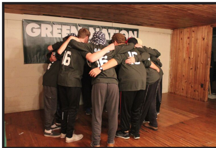
The Senior Cabin huddles on stage as they prepare a cheer for the camp during song and cheer night

Best Camp Memory: Being a counselor in senior cabin last year