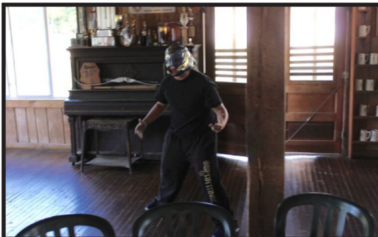
The bandit comes into the mess hall looking for the Twilight League trophy, but the Menominee men take him down before he can escape