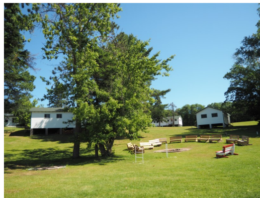
Clear skies over the cabins 6/22/15