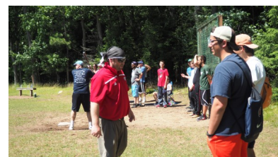
Father & Son Softball