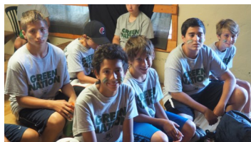
The boys ready for action