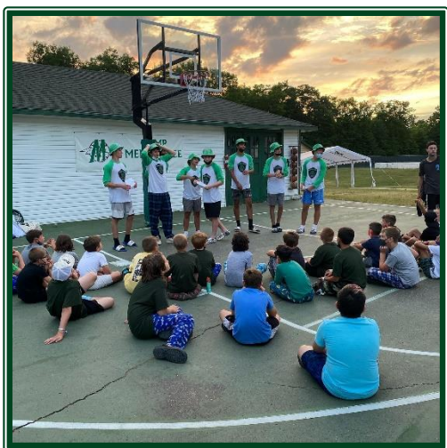
The Senior Cabin teaching the juniors songs and cheers on the near basketball courts.