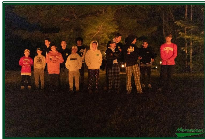
The CITs and the honorees standing by The Way Fire.

The Menominee Way is what sets our camp apart from most. It is what we believe makes someone a part of the Menominee Family and guides our actions here at camp and in our everyday lives at home. Every Sunday, here at Camp Menominee, we go out to The Way and honor eight individuals for exemplifying one of the six traits of the Menominee Way. This week, the CITs chose to honor Determination for the first Way in second session. They began the ceremony with the following speech.