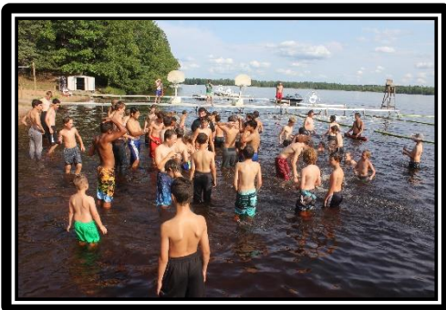
The Green team celebrate in the lake