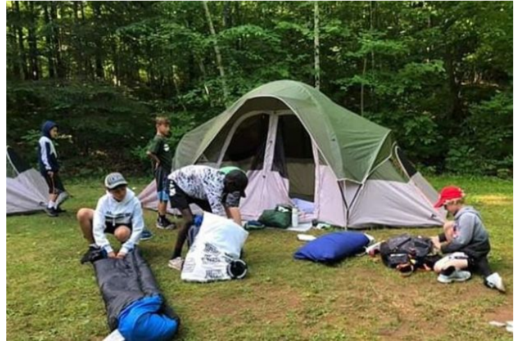
Campers setting up their sleeping bags for their night at Copperfalls a