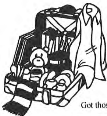
Got those bags unpacked?