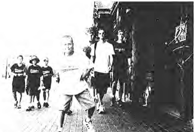
Menominee out and about in Minocqua.