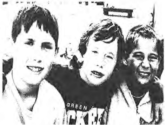
Menominee's Three Wise Men.