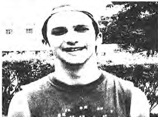
As promised yesterday, here's FEINY!