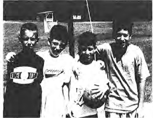
Some happy Menominee campers, about to engage in another Cola battle!

All the games played today were all very well played, with Pepsi coming out overall victors of this event. Final score; seven games to nil, in Pepsi's favor.